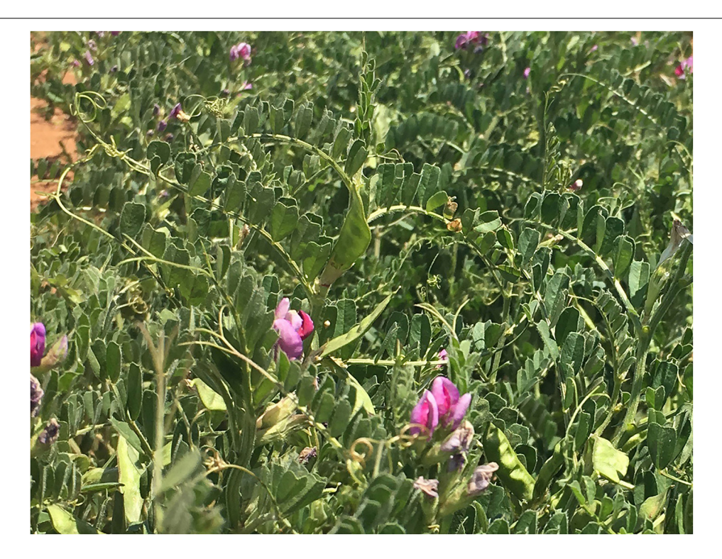
FIGURE 1 | Field grown Vicia sativa growing at the National Vetch Breeding Program in South Australia.

predominant non-essential amino acids within common vetch seed, averaging levels of 5.5 and 3.7%, respectively (Mao et al., 2015). Vetch seed also contains a much lower proportion of lipids (only 1.5–2.7%) compared with soybean seed ( Glycine max ) and this is primarily composed of unsaturated fatty acids (Mao et al., 2015).