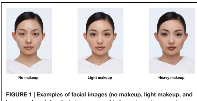
heavy makeup). For illustrative purpose, this figure shows the no makeup, light makeup, and heavy makeup versions of the same model. In the rating task (encoding phase), each participant viewed 36 models only once in one of the three versions (12 models each). The individual in this Figure has been informed consent to publish her face images.