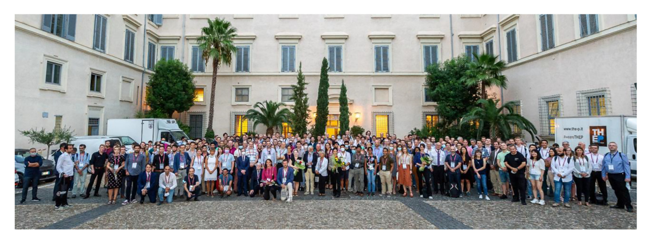
EOSAM was one of the few conferences which had a chance for on-site meetings in 2021. It was held at the University La Sapienza in Rome, Italy.

Don't miss out on the optics event of the year! Check out the detailed schedule and more information at eosam2022.org