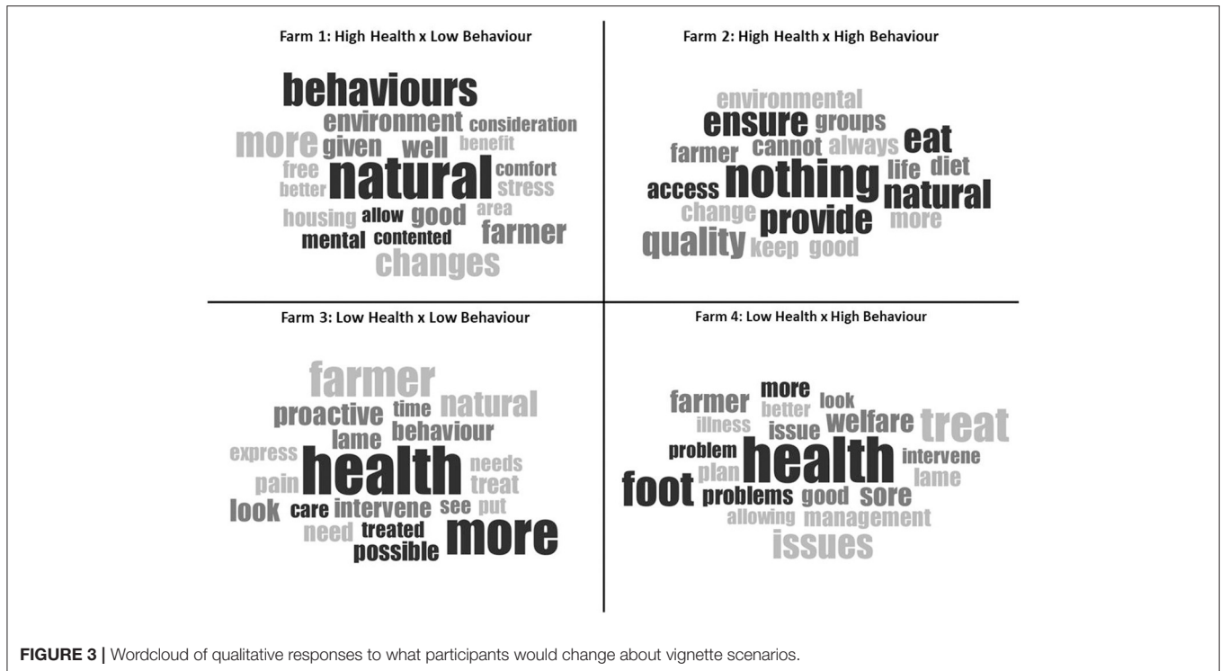
FIGURE 3 | Wordcloud of qualitative responses to what participants would change about vignette scenarios.

was rated slightly higher ( M = 9.69 , SD = 0.60 ) than “promoting natural behaviors” ( M = 8.57 , SD = 1.53 ). A paired sample t -test indicated that the difference in ratings was statistically significantly different, with minimizing health issues considered more important for overall well-being, than promoting natural behaviors by 1.124 (95% CI, 0.899–1.349); t_{(169)} = 9.870 , p < 0.001 ; Cohen’s d = 0.76 .