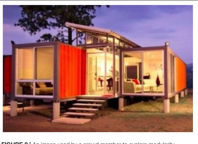
FIGURE 2 | An image used by a crowd member to explore modularity.

As such, the level of information generated by the experts was of a much more analytical nature. For the experts, the autonomous exploration of the issues on a much wider conceptual and analytical scope was a defining characteristic of the how they used the representation to generate meaning throughout the entire experiment. In contrast to using imagery to generate informational schemas and explore subproblems (as observed in the crowd), the experts used imagery to complement a deeper, more explicit problem-decomposing strategy (Cross, 1999). In the ODE the experts engaged with the design task by using a mixture of qualities found in general iconic and symbolic representations to abstractly reflect components considered key to the design task. By extracting various qualities of imagery in seemingly vague and abstract ways, a deeper, more explicit problem-decomposing strategy became evident. This approach was less concerned with a final solution; instead the imagery was used to define the parameters of the problem (Cross, 1999). A much higher level of abstract indexical meaning was engendered in the imagery by decomposing the design problem and using iconic representations to infer analytical components. In design literature, this is regarded as being a predominantly top-down and breadth-first approach (Cross, 1999).