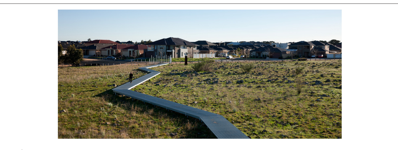
FIGURE 4 | Well-integrated. Photo taken from a grassland lookout designed to encourage users into the grassland, while encouraging them to stay on a set path to minimize damage from trampling. The entrance is signaled by public art work, housing faces the grassland and the road is used as a firebreak.

discourse but filtered through the knowledge held by other groups of non-academic experts, such as land managers, council staff, and design professionals, is a powerful tool. For instance, the intuitive and powerful "cues to care" concept (Nassauer, 1995), while existing in the literature for 20 years, was new to many of the stakeholders and in feedback was repeatedly referred to as useful.