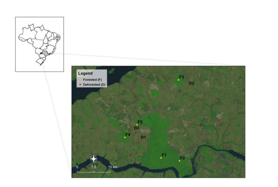
The study area, in and around Morro do Diabo State Park, located in the Pontal do Paranapanema region, Sao Paulo state. Bat surveys (yellow and red circles) were undertaken across forested (n=5) and deforested sites (n=3).

Samples were collected from bats with no clinical or neurological symptoms and in good body condition, defined as mass divided by forearm length which has been validated in temperate bats (Wilkinson and Brunet-Rossinni, 2009). All animals were released immediately following processing. Blood, saliva, and rectal swabs were collected from each captured animal, with feces and urine opportunistically collected. All samples were placed in cryovials containing 200 ml of Viral Transportation Media (VTM) and stored in liquid nitrogen in a dry shipper while in the field, then transferred to -80C freezers at the Institute of Biomedical Sciences at the University of Sao Paulo. External morphological measurements (including forearm/radius length, body length, head length) were collected by a bat taxonomist to assist in species identification. Several bat identification keys from the region were also used for reference (Reis et al., 2013; Reis et al., 2017). Sex and age were determined by the presence of scrotal