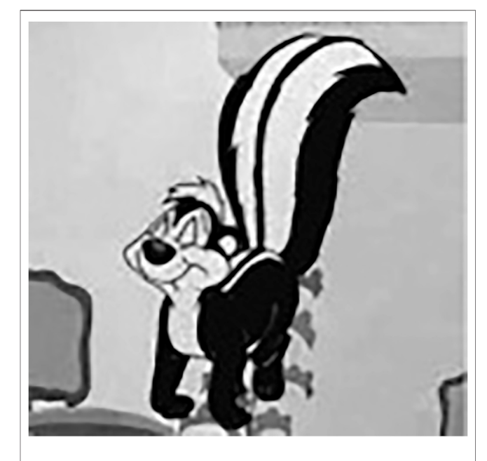
FIGURE 1 | Original scene

very iconic, these are not properties that are shared by gestures in general. Emblematic gestures, for example, like the "thumbs-up" or the "victory" sign are symbols that have to be performed according to the conventions of a certain cultural community and they do not necessarily bear similarity to what they represent. An emblem can have a certain meaning in one community and a very different one or none in another. In the following, we will only be concerned with iconic gestures.