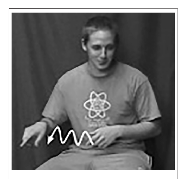
FIGURE 2 | Observer Viewpoint Gestures