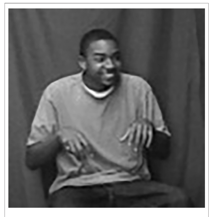
FIGURE 3 | Character Viewpoint Gesture.

Existing research on the relationship of viewpoint gestures and speech has for the most part focused on general factors influencing the frequency with which co-speech gestures are performed or which types of gestures are preferred, depending on the accompanying speech. McNeill (1992), for example,