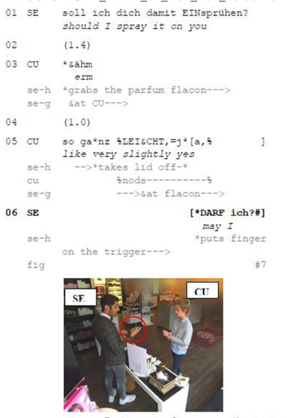
Figure 7: SE puts finger on the trigger