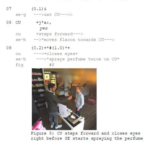
grabs the perfume flacon and looks at CU. At the beginning of CU's reluctant go-ahead (l. 05), SE takes the lid off the perfume flacon. The particle so in CU's response projects a specification of the manner, in which the action on offer is to be done. It thereby projects (conditional) acceptance of the offer. After CU starts nodding (l. 05), SE shifts his gaze to the flacon and produces a darf ich?-turn. While producing this turn, SE puts his index finger on the trigger, but does not start moving the flacon toward the customer before her response (Figure 7). In doing so, the seller orients to the customer's deontic authority, as spraying the perfume implies the intrusion into the client's personal space (i.e., private smells). In response, CU gives a go-ahead ja ("yes," l. 08), steps forward and closes her eyes (l. 09 Figure 8). She thus adopts a posture to receive the spray. Right after the onset of

her go-ahead and her bodily repositioning, SE starts spraying (l.