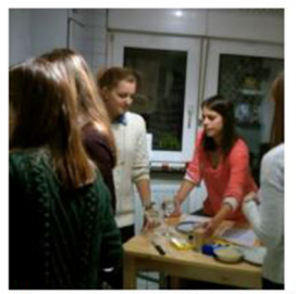
Figure 2: CS takes glass with rice.