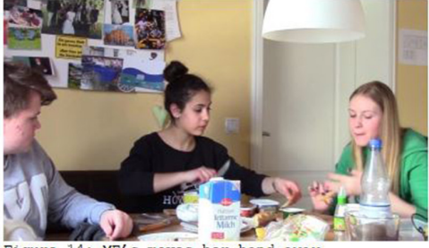
Figure 14: ME's moves her hand away