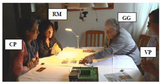
Figure 9: GG reaches out and grabs the card.