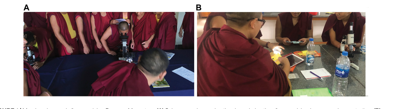
FIGURE 1 | Morning class and afternoon labs, Drepung Monastery. (A) Science monks running the show during the afternoon lab microscope demonstration. (B) Using Foldscopes and posting images.

Dreprung, it meant that sentient microscopic creatures are regulated by a special set of rules. In Buddhism, all sentient beings possess Buddha-nature and have human connections through cycles of rebirth. Therefore, Buddhist are not permitted to harm, kill, or eat sentient beings. These commandments have major implications for the afterlife. This perspective not only mandated a vegetarian diet but also had a profound impact on our lesson plans, experiments, and discussions about the organisms of the microscopic world.