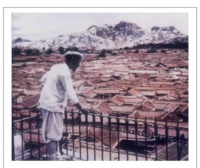
FIGURE 2 | Photograph of Seoul from the Sontag Hotel, c. 1902, close to the location of Antoinette Sontag's rooftop sighting of an urban leopard. Note the high level of urban development and the density of dwellings.

Socio-cultural factors likely also played an important role in facilitating human-leopard coexistence in this urban landscape. Contemporary accounts regularly recorded a widespread and