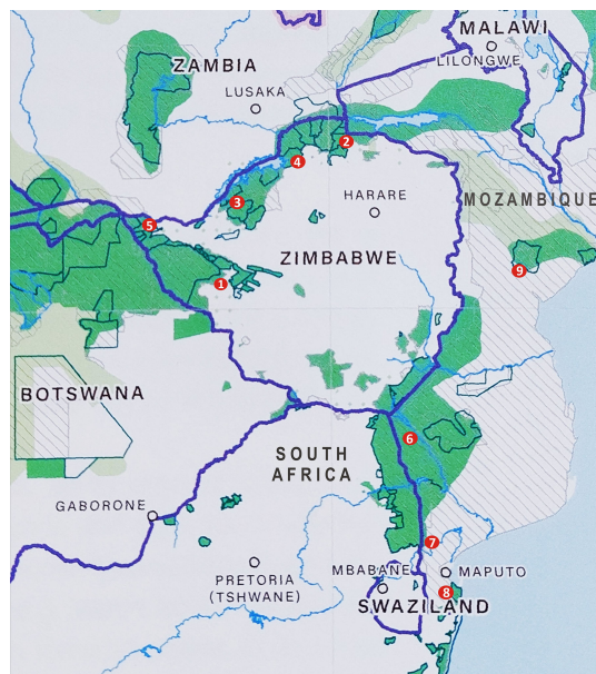
FIGURE 1 | Map of elephant range (green) in south-eastern Africa with HEC study sites marked. Zimbabwe sites: 1 Tsholotsho District; 2 Mbire District; 3 Binga District; 4 Hurungwe District; 5 Victoria Falls. Mozambique sites: 6 Limpopo National Park periphery; 7 Moamba District; 8 Maputo Special Reserve; 9 Gorongosa National Park periphery.

liquids applied to the sisal twine were old engine oil alone or creosote (a tar-based wood preservative, Table 2 ).