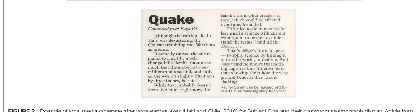
FIGURE 2 | Example of local media coverage after large earthquakes (Haiti and Chile, 2010) for Subject One and their classroom seismograph display. Article from the Bucks County Courier Times used under a Creative Commons license.

students understand the structure of the Earth and that the Earth is actually moving underneath them. They talk to their parents about it. The local news came in and talked to the students as "local experts" when large earthquakes were in the news ( Figure 2 ).