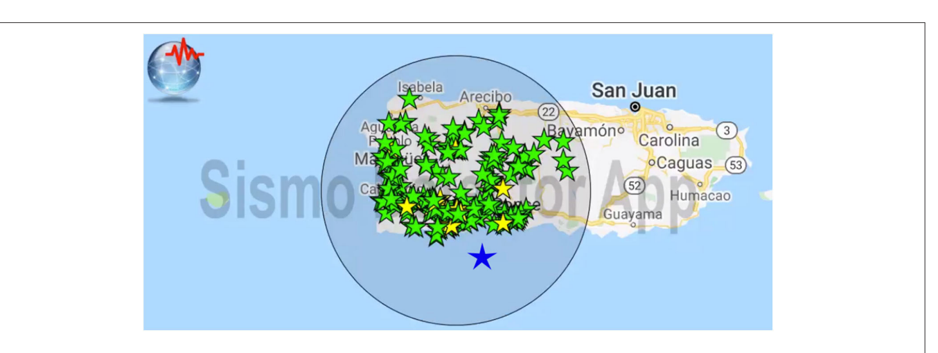
FIGURE 2 | Felt reports sent by users of the Earthquake Network app after a 3.6 magnitude earthquake in Puerto Rico on 26 January 2020, 01:59:26 UTC (EMSC catalog ID 823242) within 60 s from origin time. Blue star is the earthquake epicenter. Green (mild) and yellow (strong) stars are felt reports localized using smartphone spatial coordinates.