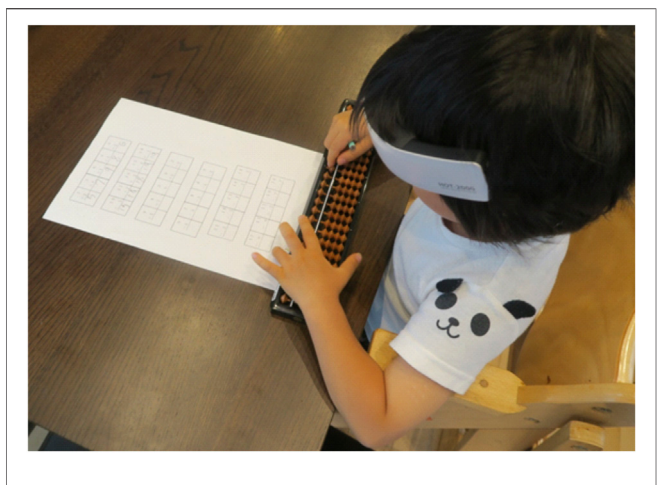
FIGURE 2 | Child calculates the task with an abacus.