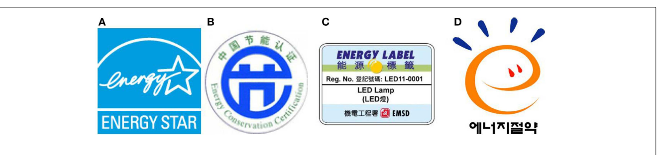
FIGURE 2 | Endorsement labels – (A): ENERGY STAR, (B): Chinese Energy-Conservation Program, (C): Recognition-type Energy Label, (D): South Korean High-efficiency Appliance Certification Program.