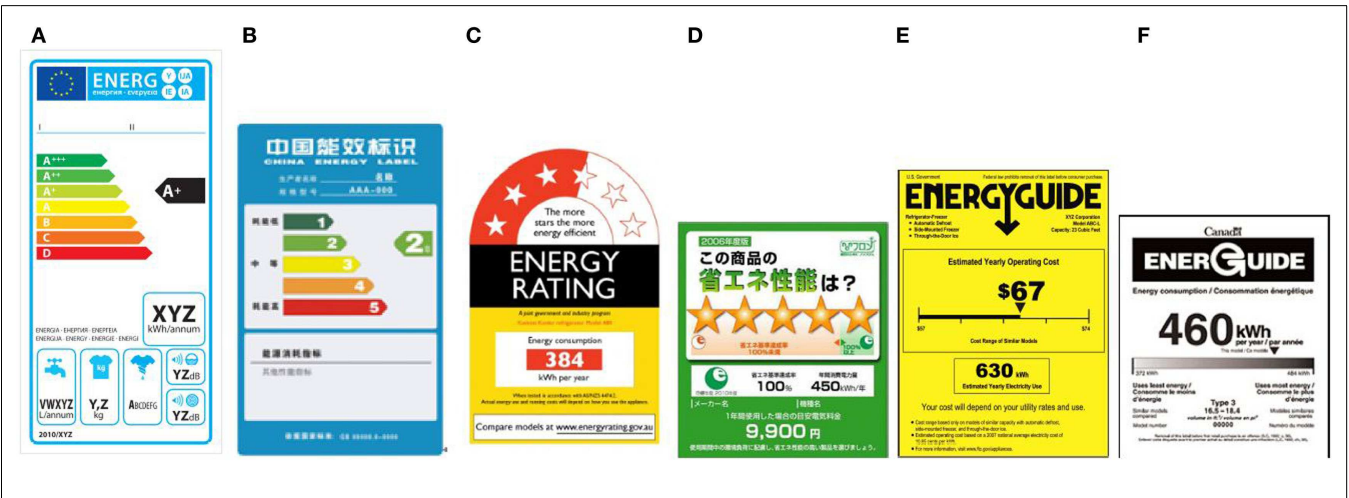
FIGURE 3 | Comparative labels – (A): EU Energy Label, (B): Chinese Energy Label, (C): Australian Energy Label, (D): Japanese Energy Label, (E): US EnergyGuide, (F): Canadian EnerGuide.

FIGURE 2 | Endorsement labels – (A): ENERGY STAR, (B): Chinese Energy-Conservation Program, (C): Recognition-type Energy Label, (D): South Korean High-efficiency Appliance Certification Program.