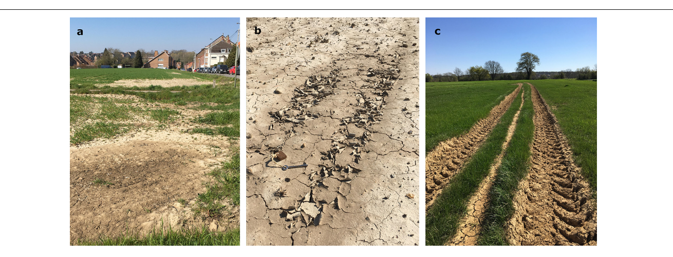
FIGURE 2 | Example of soil degradation brought about by compaction. (a) Field in Braine-l'Alleud (Belgium) where the use of heavy machinery, including sugar beet harvesters, over the years has resulted in soil compaction, lack of drainage, and difficulty for crops to germinate, (b) in this same field, evidence of dispersion of the soil at the surface, which at this point (April 4, 2020) is as hard as concrete when dry, (c) field soil in Lamairé (Deux-Sèvres, France) where pesticide application using heavy machinery has resulted in intense compaction. At various places, the tractor tracks are 20 cm deep, and the soil is once again extremely hard.

Protracted dry spells lead to significant wind erosion of soils in dryland areas, representing 40% of the world's land surface (Millennium Ecosystem Assessment, 2005) and 30% of the world population (UNCCD, 2014). This wind erosion gives rise to dust storms, which had not been seen since the 1930s but reappeared about a decade ago in various parts of the world (e.g., Baveye et al., 2011; McLeman et al., 2014; Barbosa and Olsson, 2019; Eekhout and De Vente, 2019; Middleton et al., 2019), and are forecasted to become even more frequent in the future. Beside dust storms, longer dry spells between rains could also cause severe water deficits for plants, e.g., crop failure in agricultural fields, and they could prolong the "hunger season" (the interval between two