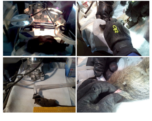
FIGURE 2 | Surgical table and implant procedure for wild Norway rats, Rattus norvegicus , captured on Eastern Long Island and monitored from January 14–May 15.