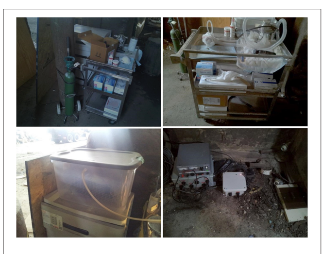
FIGURE 1 | Mobile anesthetic lab and outdoor RFID system for wild Norway rats, Rattus norvegicus , captured on Eastern Long Island and monitored from January 14–May 15.