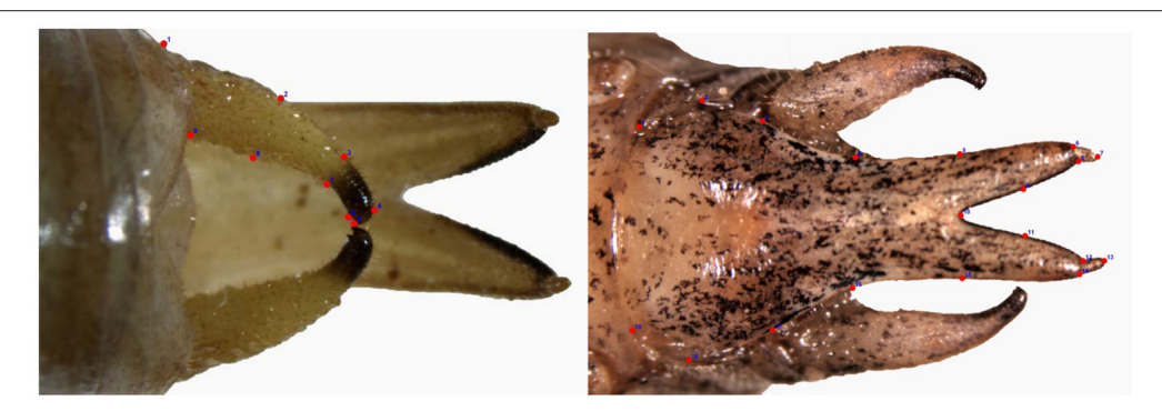
FIGURE 1 | (A) Cerci. (B) Sub-genital plate. Approximate locations of landmarks denoting the boundary of the right cercus (A) and the sub-genital plate (B) used in landmark-based geometric morphometrics.

Ranganathan and Borges, 2011). Random forest is suitable for the present study mainly because: