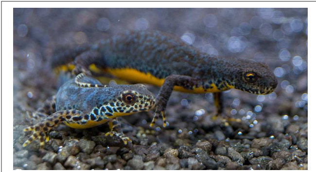
FIGURE 1 | Male (left) and female (right) Alpine newt, Ichthyosaura alpestris .

well as in their dorsal and lateral coloration. Yet, both sexes show strikingly orange bellies ( Figure 1 ).