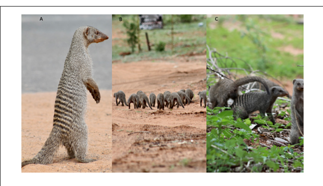
FIGURE 3 | (A) Vigilance, (B) flight, and (C) scent marking behavior in a banded mongoose study troop.

lowest level of olfactory communication by land type (Table 2). The undeveloped land areas also had the lowest olfactory communication counts, which were significantly different from all other land types (p < 0.0005). These land types occur largely around and near human-modified landscapes (i.e., lodges, urban, and residential). In contrast to the other land types, predation (human and animal) and territorial defense needs appear to be reduced. Predators are rare due to human conflict and persecution. Human presence in these areas is also relatively rare due to a lack of infrastructure and roads and the occurrence of dangerous animals such as buffalo and elephant. Territorial defense may still be needed, however, against intrusion of conspecifics, but the lack of human refuse and anthropogenic denning resources may lower competition for these areas in comparison to the urban and lodge landscapes (Laver and Alexander, 2018).