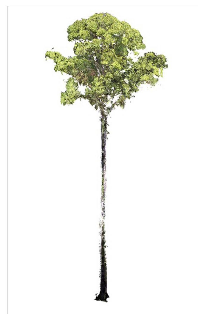
FIGURE 1 | A 3D point cloud of the tallest tropical tree generated from fusing 2 data sources: TLS pointclouds from a RIEGL VZ-400 (RIEGL Laser Measurement Systems GmbH); and pointclouds derived from applying structure-from-motion algorithms to video from a UAV flight up and around the tree. Still images were extracted from the UAV-based video footage using fimpeg, and these were then used to create pointclouds using Pix4Dmapper software package (Pix4D SA,. Switzerland). The TLS and UAV-dervied pointclouds were fused together using CloudCompare software (version 2.10.1, retrieved from http://www.cloudcompare.org/), and the TLS points were colored based on the color of the nearest neighboring UAV point. Interactive data and downloads can be found at https://skfb.ly/6KXXH and Shenkin et al. (2019).

"Menara" is a Shorea faguetiana tree (common name Yellow Meranti), of the Dipterocarpaceae family, a taxon that dominates the humid lowland rainforests of SE Asia. As verified by measuring tape, it has a height of 100.8 m (distance to lowest part of the buttress; distance to lowest part of bole is 98.90 m, distance to highest base point of bole 96.26 m). This tree exceeds previous record holders including another tree in Danum Valley estimated at 94.1m by airborne LiDAR (ALS) in 2016 as well as a media report of a 96.9m Shorea faguetiana recorded in Tawau Hills National Park, Sabah, in May 2018<sup>1</sup>. This makes it