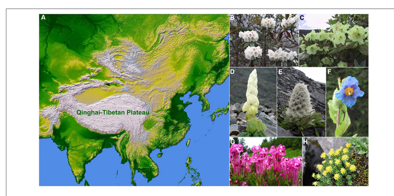
FIGURE 1 | Geographic location of the Qinghai-Tibetan Plateau (A) and representative plant groups: (B) Rhododendron roxieanum Forrest ex W.W.Sm.; (C) Rhododendron wardii W.W.Sm.; (D) Rheum nobile Hook.f. & Thoms., showing "glasshouse-like" morphology; (E) Saussurea laniceps Hand.-Mazz., showing