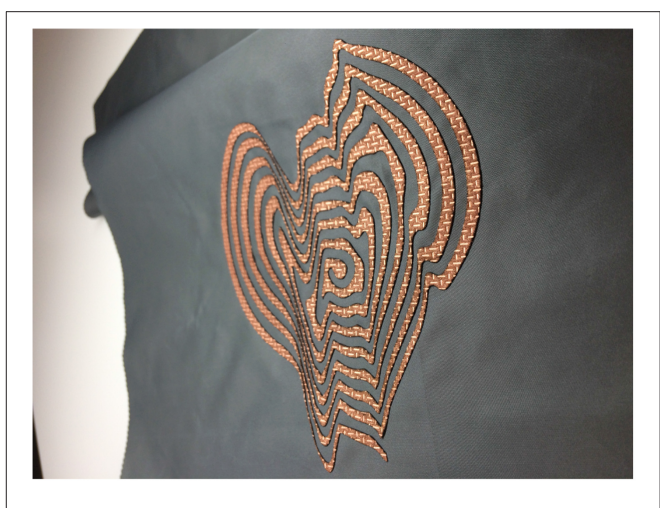
FIGURE 3 | Textile speaker (EJTECH, 2017b).

The above section surveyed the technologies used within e-textiles developed for computational audio, this section will look at the application areas where e-textiles are repeatedly being employed for audio-related tasks. There are five