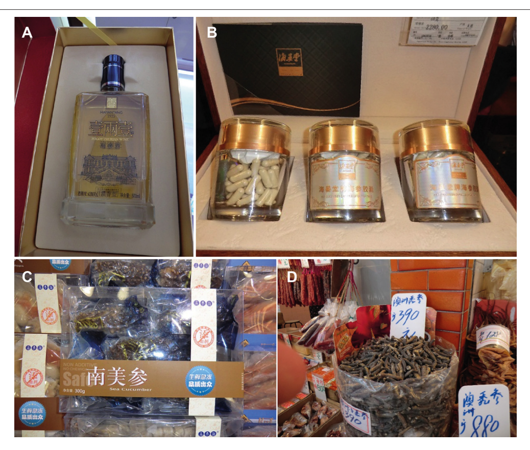
FIGURE 2 | Holothurian wine (A); capsules with contents of sea cucumbers (B); frozen sea cucumber from a supermarket (C); "Australian bald" sea cucumbers sold in Hong Kong (D).

( Figure 2C ). Some sea cucumbers have labels asserting they are "non-additive" and "chemical free" "to assure consumers that no additives have been used to artificially increase the reconstitution ratio of the product" (Purcell et al., 2014a, p. 49). One Beijing-based trader described the potential for "green" labeling that focused not on environmental sustainability of the production, but on food safety: "in the past nobody asked about these things, but more and more people do now."