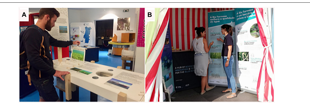
FIGURE 3 | REASE activities for informal education include, among others, (A) interactive permanent exhibitions on ES of coastal vegetated ecosystems at science centers, and (B) roll-ups exhibitions in shopping malls, nautical fairs and in schools. All identifiable individuals have delivered a written consent for the publication of the images.

Then it was necessary to implement exciting projects that involved not only laboratory work but most importantly, field excursions and sampling so that the teachers and their students get in touch with the natural environments and may break the monotony of the day to day work within the school buildings. For this, we developed a close collaboration between researchers and educators. A model project was developed, the Blue Carbon Project (see text footnote 6), whose field and laboratory protocols were tested and improved with teachers. A critical component was the creation of educational materials, including information that allows participants to understand the scientific background, a field kit with everything necessary to collect samples and field information, clear and precise field and laboratory protocols and laboratory conditions to analyze the samples. Potential educational benefits of REASE projects range from acquiring skills needed to collect data accurately to critical scientific