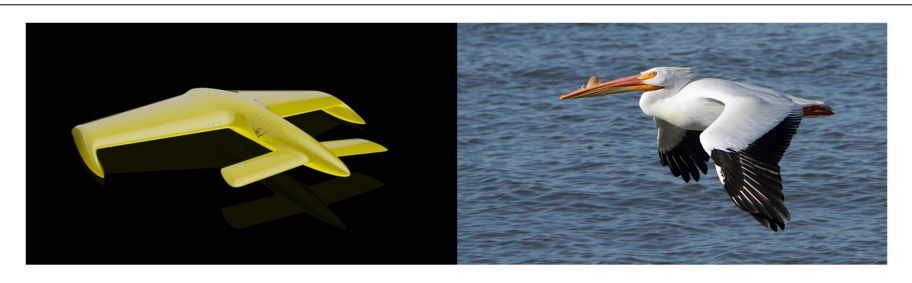
FIGURE 6 | The Shearwater vehicle concept under development.