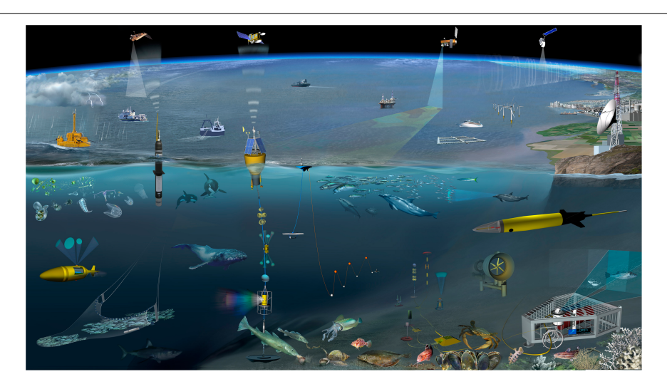
FIGURE 1 | A depiction of the many autonomous and remote sensing platforms that comprise an ocean observation system.

part of routine operating procedures. With the role that they can play in the coming decade, this section on standards and best practices was included in our review and vision of autonomous vehicles.