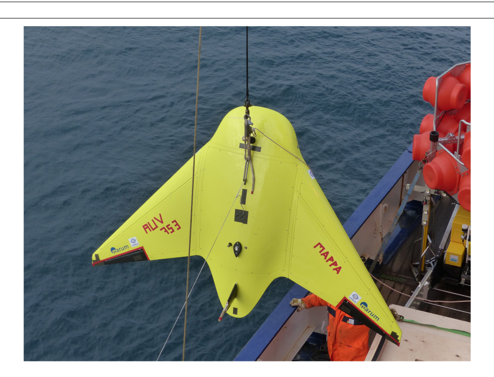
FIGURE 3 | The Blended-Wing glider designed as part of the ROBEX project (, a cooperation project between MARUM and Airbus with support by MBARI).