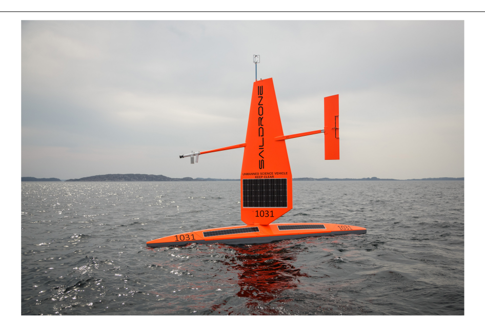
FIGURE 2 | SailDrone deployment in Norway.