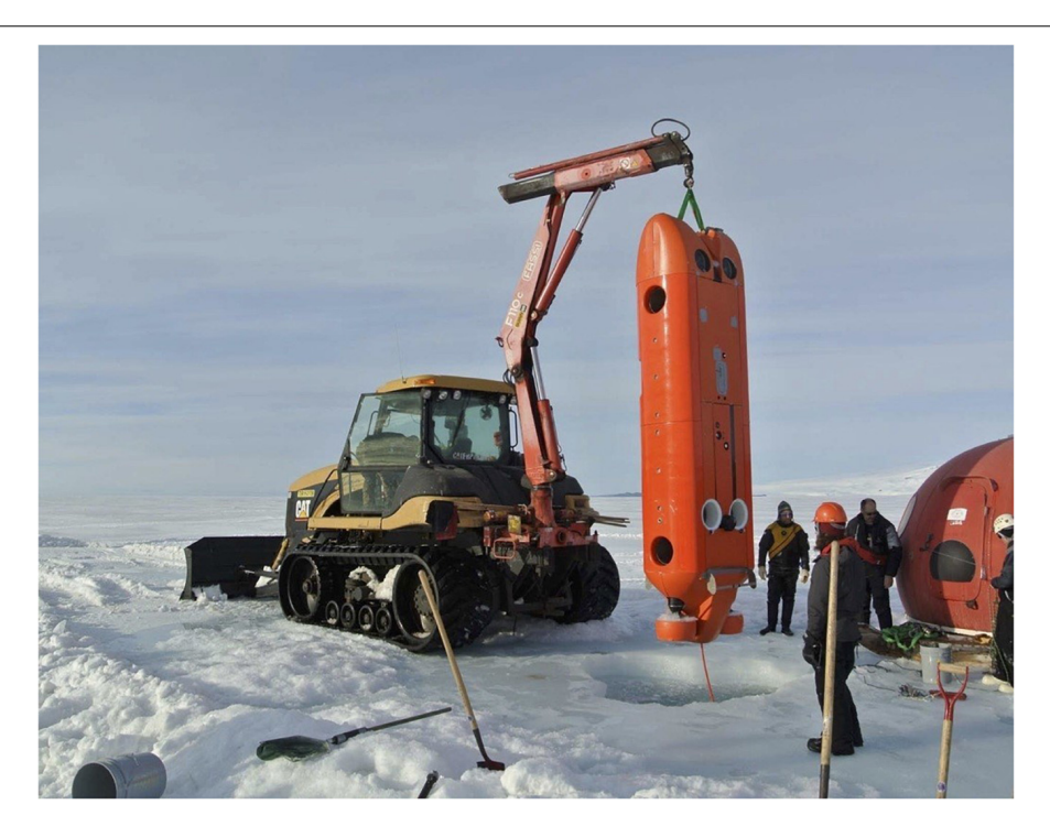
FIGURE 4 | Stone Aerospace's ARTEMIS vehicle being launched into the Antarctic ocean through a drilled hole.

limitations, while adding buoyancy engines to a conventional AUV can reduce the energy needed to maintain depth, which increases range and endurance compared to solely using propeller propulsion (Sauser, 2010). Similarly, combining the type of platform stability and manipulation capabilities typical of ROVs with AUV platforms offers significant opportunities for close-up observations, sampling, and infrastructure maintenance that was previously only possible with ship-supported ROVs (Johansson et al., 2010).