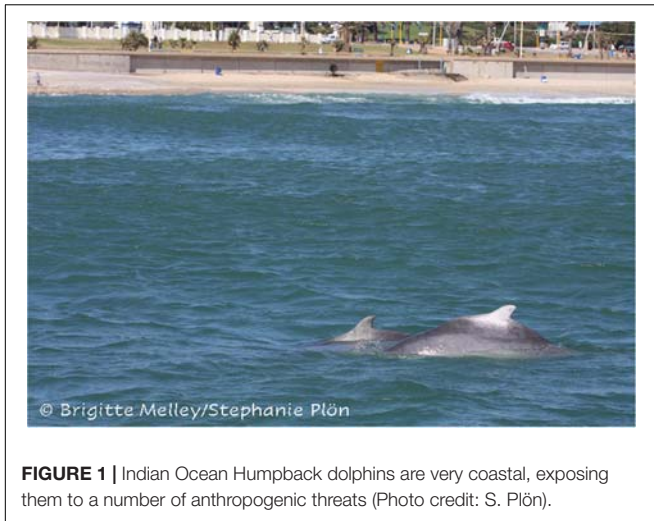
FIGURE 1 | Indian Ocean Humpback dolphins are very coastal, exposing them to a number of anthropogenic threats.

This indicates a more dire situation than previously estimated (Plön et al., 2016).