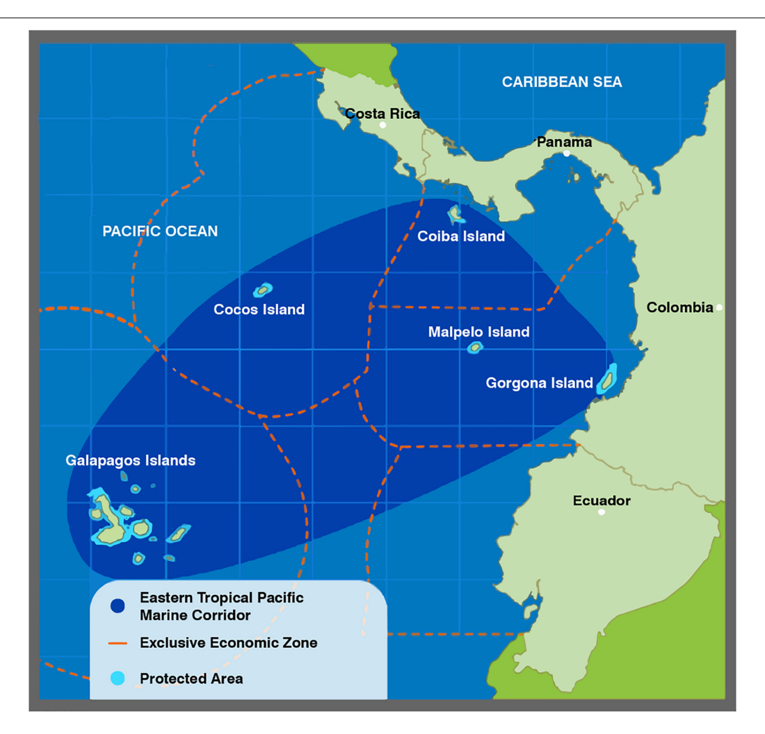
FIGURE 1 | Proposed Eastern Tropical Pacific Marine Corridor (CMAR). This map was designed by the MarViva Foundation in 2005 as a tool to visualize the area which could eventually be delimited as the marine corridor. The official geographic delimitation of CMAR remains pending. Available at http://cmarpacifico.org/web-cmar/quienes-somos/que-es-el-cmar/.

(Pacoureau et al., 2021) and a main reason for the decline of many migratory marine species in the ETPO (Peñaherrera-Palma et al., 2018, p. 71, 112). As well as intense fishing pressure from national vessels (WildAid, 2010, p. 2; The Economist, 2020; Hearn et al., 2021, p. 8), the high seas areas in this region have been subject to increased fishing effort in recent years by foreign flagged fleets, often loitering adjacent to or entering a marine protected area (Alava and Paladines, 2017; Collyns, 2020), a trend which is predicted to worsen in the future. The Intergovernmental Panel on Climate Change (IPCC) has identified the ETPO as an area facing complex fishing governance challenges given that fisheries productivity may be less affected by climate change in certain areas due to the presence of colder oceanic currents (Hearn et al., 2021, p. 10).