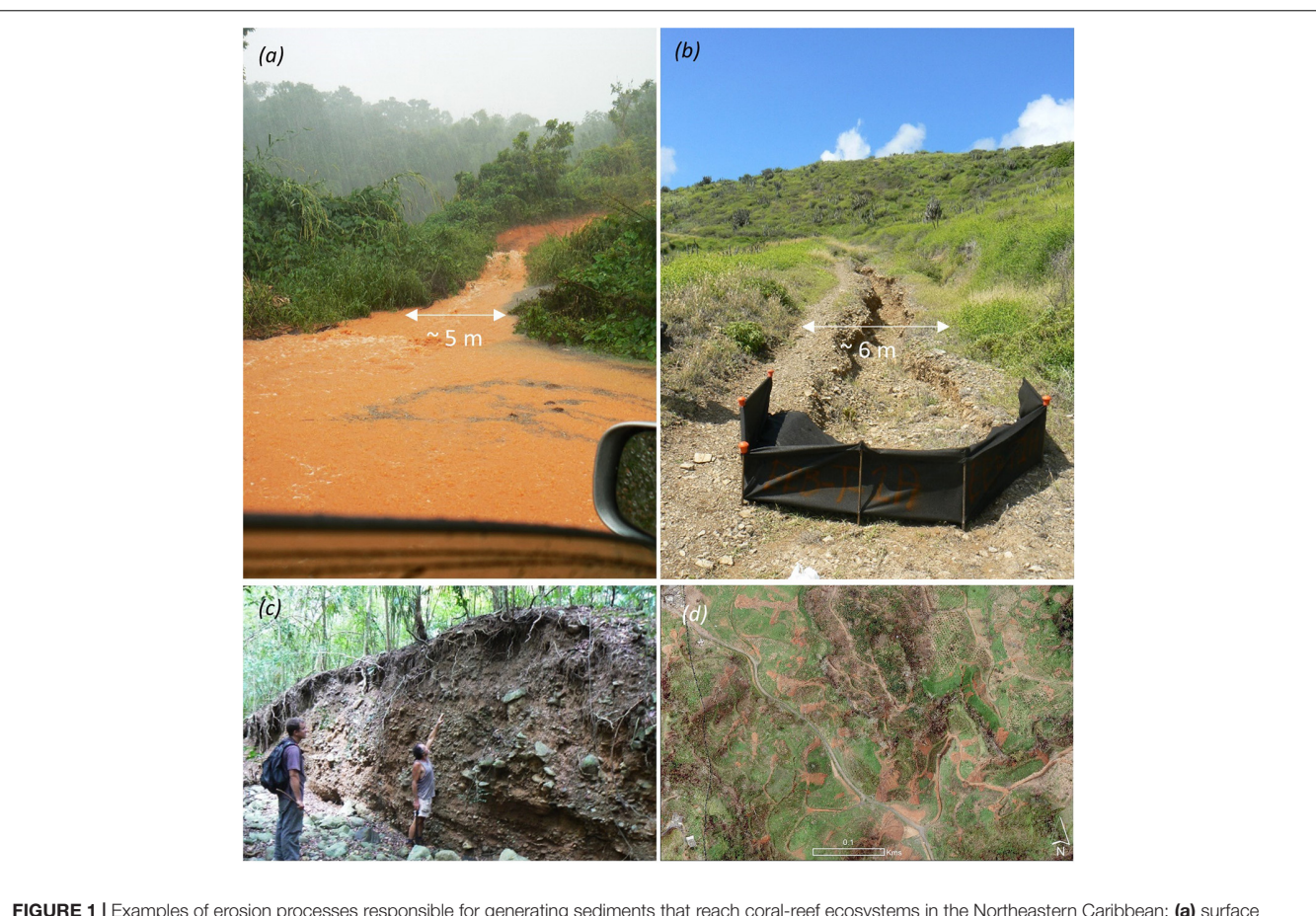
FIGURE 1 | Examples of erosion processes responsible for generating sediments that reach coral-reef ecosystems in the Northeastern Caribbean: (a) surface erosion due to overland flow on unpaved roads and agricultural areas (Río Grande de Añasco-PR); (b) gullying of footpaths (East End, St. Croix-USVI); (c) streambank erosion (Coral Bay, St. John-USVI); and (d) shallow landslides (Yauco-PR).

exactly equates to exposure levels as those also commonly depend on the distance from the outlet to the corals, sediment particle size distribution and mineralogy, and oceanic factors controlling direction, mode and rate of sediment transport and deposition.