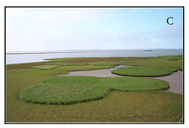
FIGURE 2 | Blue carbon ecosystems in Brazil (South Atlantic). (A) Seagrass meadows - Cajueiro da Praia - Piaui state. Photo: K. Barros; (B) Mangrove forest - Rio Acarau - Ceara state. Photo: R. C. Maia; (C) Salt marshes - Lagoa dos Patos - Rio Grande do Sul state. Photo: C.S.B. Costa.