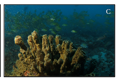
FIGURE 3 | The Blue Amazon (Brazilian Economic Exclusive Zone, South Atlantic) contains potential and non-actionable BC ecosystems that could contain vast amounts of stored carbon. (A) Hypersaline tidal flat (E.g., Barra do Ceara-Ceara state.) (B) Macroalgal beds (E.g., Arquipelago de S.Pedro e S.Paulo-Pernambuco state.); (C) Marine animal forest (E.g., Parque Estadual Marinho da Pedra da Risca do Meio - Ceara state.).