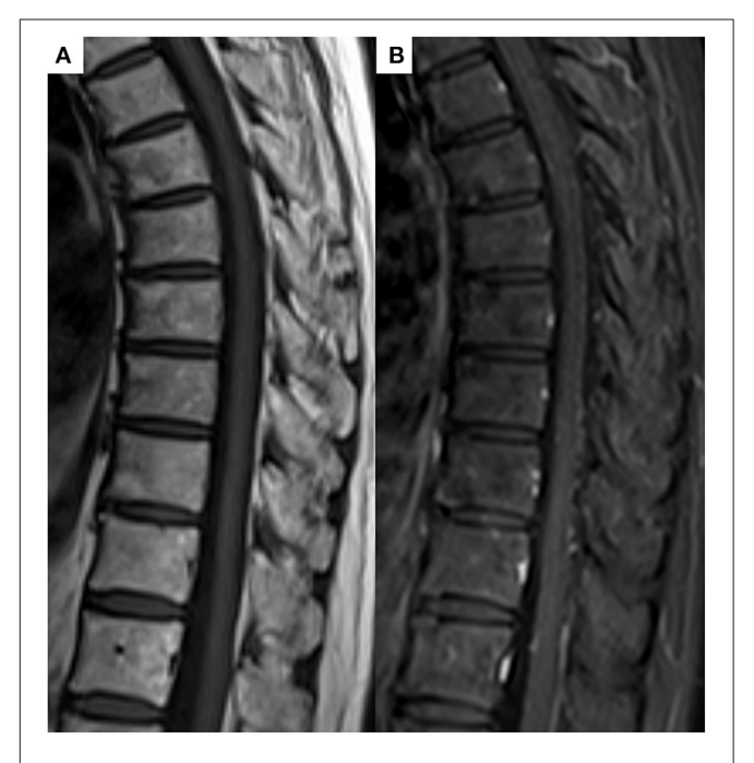
FIGURE 4 | (A) Follow-up T1-weighted image and (B) contrast T1-weighted image after 5 months showed complete resolution of all previously noted bony lesions.

by synovitis (inflammation of the joints), acne, pustulosis (thick yellow blisters containing pus) often on the palms and soles, hyperostosis (increase in bone substance) and osteitis