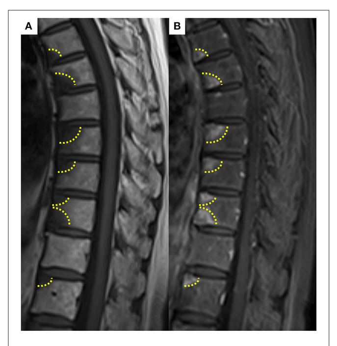
FIGURE 3 | (A) Spine magnetic resonance imaging showed hypointense area on T1-weighted image, (B) abnormally enhancing effect on contrast T1-weighted image in contiguous anterior thoracic vertebral corners. These multiple vertebral lesions had a characteristic semi-circular pattern (dashed line) in contiguous vertebral body segments.

by synovitis (inflammation of the joints), acne, pustulosis (thick yellow blisters containing pus) often on the palms and soles, hyperostosis (increase in bone substance) and osteitis