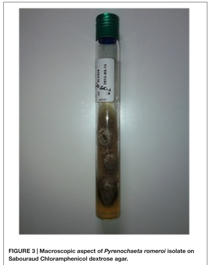
FIGURE 3 | Macroscopic aspect of Pyrenochaeta romeroi isolate on Sabouraud Chloramphenicol dextrose agar.

Local examination revealed a soft to firm mass at the first radius of the right foot. It was slightly mobile, tender with normal overlying skin, and painful to pressure. The rest of clinical examination was normal. Biological investigations including hemogram, chemistry panel, C Reactive Protein level, liver enzyme level, serum protein electrophoresis, and serum