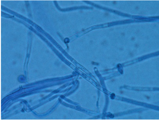
FIGURE 4 | Microscopic aspect of P. romeroi isolate (Blue cotton, ×40).

the first metatarsal, associated to hyposignal T1 and hypersignal T2 with peripheral enhancement after injection ( Figure 1 ), suggesting a diagnosis of synovial cyst.