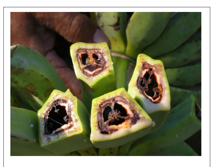
FIGURE 3 | Internal fruit symptoms of blood disease of banana.

bright yellow before becoming necrotic and dry. The pathogen rapidly colonizes the entire plant, and suckers will also wilt and die (Eden-Green, 1994b).