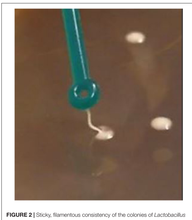
paracasei DG grown on vk-MRS agar plates.

that this probiotic bacterium can survive gastrointestinal transit when consumed via the formulation Enterolactis in drinkable vials. Overall, we found the highest concentration of viable L. paracasei DG in the fecal samples obtained between 4 and 8 days after the beginning of Enterolactis intake. The highest concentration of DG isolated from a single subject ranged between 3.6 and 6.7 log<sub>10</sub> CFU per gram of feces (mean of 6.1 log10 CFU/g). In particular, we observed profound inter-subject variability in terms of kinetics of persistence. In fact, while from some subjects (e.g., S1) DG cells were retrieved from the first evacuation after intake of the probiotic product, from others (e.g., S2 and S9), viable DG cells were isolated only after the end of the 1-week probiotic intake period (Figure 3). In general, however, viable DG cells were isolated from the feces of the volunteers until 5 days after the cessation of Enterolactis intake (Figure 3).