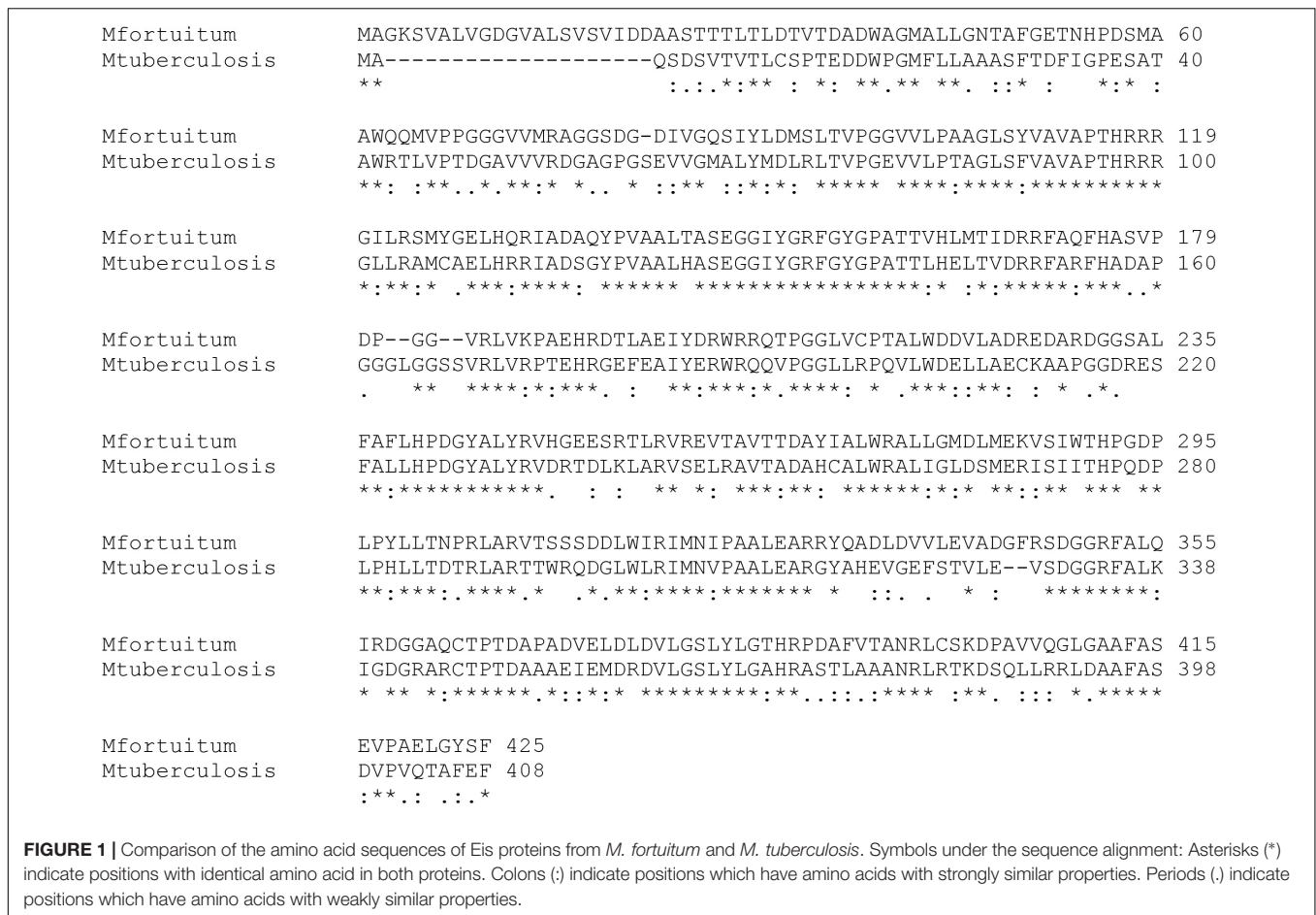
TABLE 1 | MICs (µg/ml) of antibiotics of different structural families in the M. smegmatis mc 2 155 strains that overexpress eis gene from M. fortuitum .