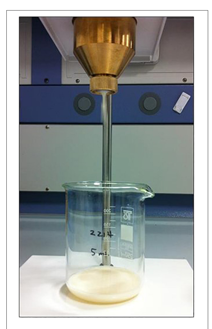
FIGURE 2 Ford cup used to measure the viscosity of fermented milk by weighing the milk flowing through an orifice of 3 mm diameter.

lactose as carbon source and to reach the final pH of 4.5 faster than two dairy isolates Ldb 2214 and Ldb 147. The frequent presence of Weissella strains in different fermented products