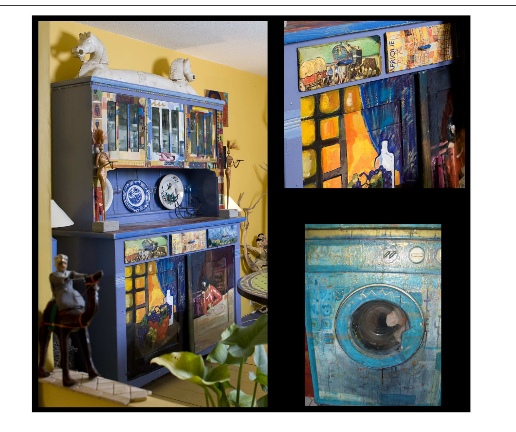
FIGURE 3 | Addictive period. Examples of furniture and equipment being transformed in pieces of art illustrating the change in quantity and in surfaces of application.

behaviors performed for long periods of time at the expense of other activities (33). To our point of view, creativity is the opposite of punding in its fundamental characteristics: by definition, creativity implies: (i) novelty, not repetitiveness and (ii) usefulness, not aimlessness. In fact, punding is even discussed to be included in the rubric of stereotypies (34).