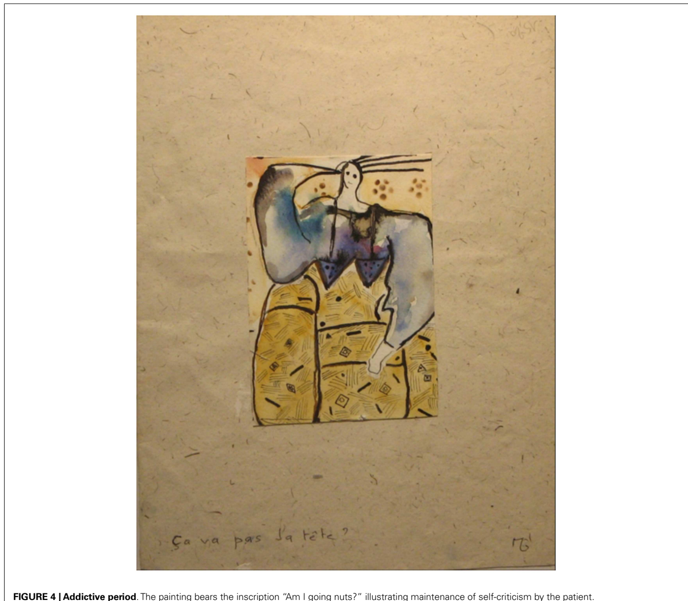
FIGURE 4 | Addictive period. The painting bears the inscription "Am I going nuts?" illustrating maintenance of self-criticism by the patient.