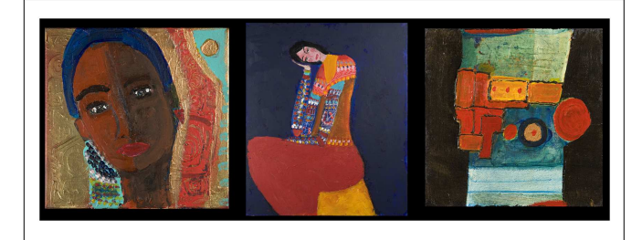
FIGURE 1 | Three works from her first, non-addictive period.

equilibrium, and led to hospitalization, reduction in dopaminergic treatment, and the introduction of clozapine. A subsequent increase in akinesia required higher doses of levodopa, which in turn induced the onset of motor complications. As a result, STN DBS surgery was performed in 2009. Neurosurgical treatment led to improvement in motor fluctuations and reduction of dopaminergic therapy. Her creative activity remained rich, and was judged by the patient herself to be more tranquil and satisfying. She mostly sculpts now ( Figure 5 ). She did not dare to pick up a paintbrush for a long time. She was afraid of falling prey to the devastating addiction to painting again. Here is her own account: I've