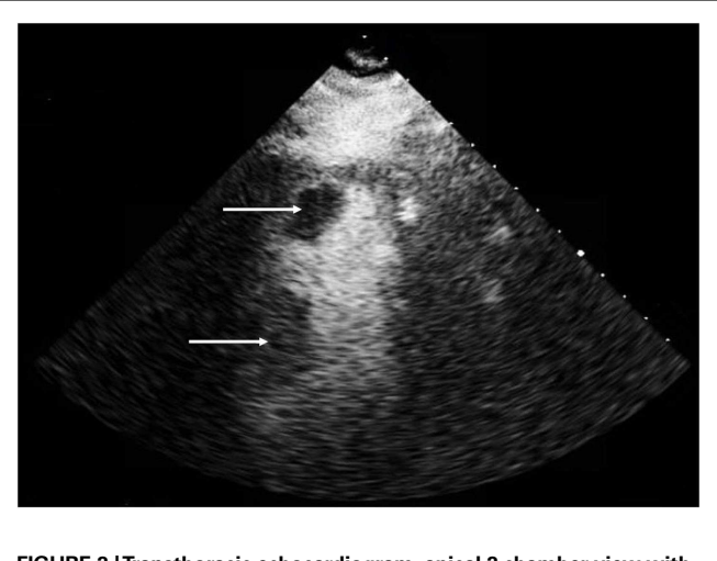
FIGURE 2 |Transthoracic echocardiogram, apical 2 chamber view with contrast demonstrating a left ventricular apical thrombus (2.4 \text{ cm} \times 1.4 \text{ cm}) (top arrow) and a second thrombus (1.6 \text{ cm} \times 2.2 \text{ cm}) (bottom arrow) adherent to the interventricular septum.

of 8% (4, 5). TTE is 23% sensitive and 96% specific for LVT detection (6), improving to 92% sensitivity when a high prevalence of LVT was anticipated (7) and remains the preferred method for detection. If image quality is poor or LVT risk is high with negative or equivocal echocardiography, contrast enhanced cardiac MRI (CMR) should be considered. It has a sensitivity of 88% and specificity of 99% (6).