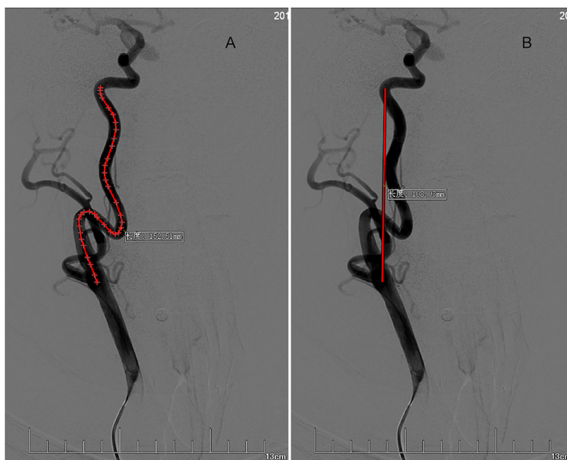
FIGURE 1 | Measurement of tortuosity index. Arc length (A) and chord length (B) of right extracranial internal carotid artery (eICA) tortuosity is measured in the anteroposterior view of carotid artery angiography from the bifurcation point of the carotid artery to the distal end where ICA entered the carotid canal. For this right eICA, arc length = 152.51 mm, chord length = 108.03 mm. Tortuosity index = [(arc length/chord length – 1) × 100] = 41.

First, the demographic and clinical data were compared between cases and age- and sex-matched controls. The difference of normal distribution variables of cases and controls was tested by the paired Student's t -test. We performed McNemar's tests to determine whether there were differences in dichotomy variables (hypertension, diabetes mellitus, coronary artery disease, hyperlipidemia, and habitual smoker) between the two groups. Crude odds ratios (ORs) and 95% confidence interval (95% CI) were calculated using Miettinen and Nurminen method. We conducted conditional logistic regression to estimate the adjusted OR along with its 95% CI, vascular risk factors and the variables that reached a liberal statistical threshold of p < 0.2 were included in conditional logistic regression analysis.