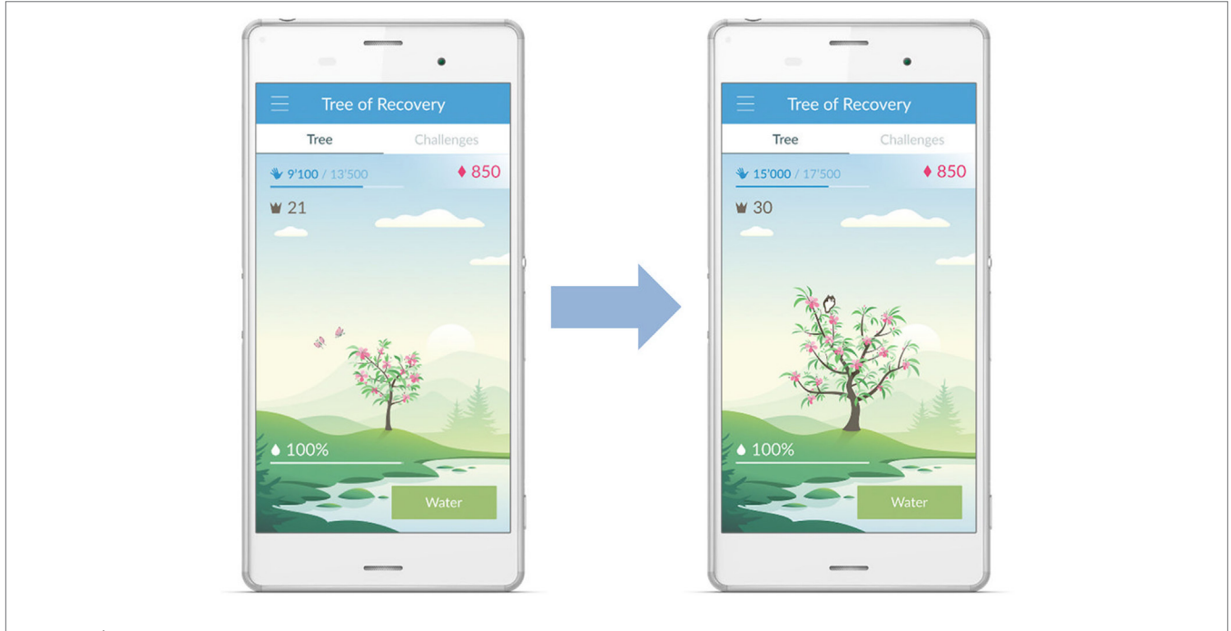
FIGURE 3 | "Tree of Recovery." Legend: a figurative representation of the amount of upper limb use in daily life. Arm Activities are displayed in blue numbers and the earned diamonds in red.

To increase study compliance and adherence, both intervention and control group subjects will receive weekly reminder calls (six in total) to wear the "ARYS™|tracker" devices every day. These