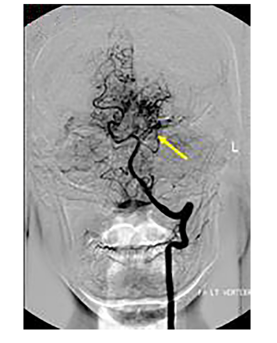
FIGURE 3 | AP views following left vertebral artery injection showed moyamoya phenomenon around the proximal left PCA (arrow).

When last assessed, he had experienced no further TIA or stroke over the following 9.5 years. He had intermittent abdominal pain and vomiting exacerbated by eating, attributed to mesenteric ischaemia, with reduced oral intake and weight loss. He was taking aspirin 150 mg daily, atorvastatin 10 mg nocte, amlodipine 10 mg daily, esomeprazole 40 mg daily, hyoscine butylbromide 10 mg BD, and paracetamol 1g QDS PRN. He continued smoking 10 cigarettes daily, but successfully stopped drinking alcohol. Neurological exam was unchanged.