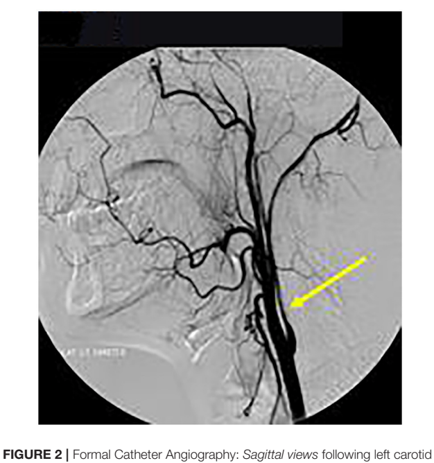
injection showed \geq 75% extracranial LICA stenosis (arrow). LICA was occluded in the supraclinoid segment after the left ophthalmic artery origin with moyamoya phenomenon (not shown).