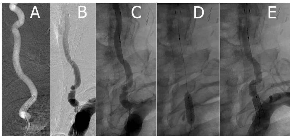
FIGURE 1 | (A) Pre-stent left VA (B,C) left VA with Accunet prior to stent deployment (D) implanting left VA Herculink stent with balloon angioplasty (E) post-stent left VA.

*CCA, common carotid artery; EPD, embolic protection device; F/U, follow-up; ICA, internal carotid artery; MCA, middle cerebral artery; VA, vertebral artery.