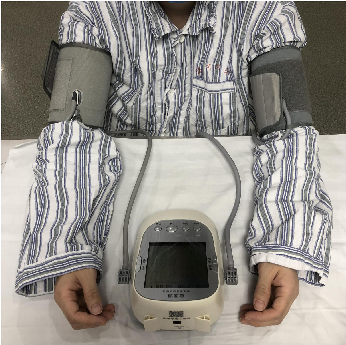
FIGURE 1 Remote ischemic conditioning (RIC) with an electronic tourniquet cuff device.