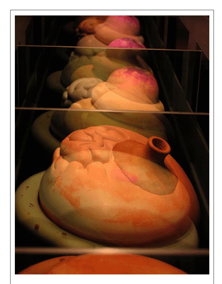
FIGURE 9 | Three is Company.

and "it" are nearly identical specimens of biological standard equipment. The identity that arises from this equipment is comprised of a unique collection of memories and desires conditioned by embryological and biographical history. The self is not a fixed entity but a dynamic process of relationships.