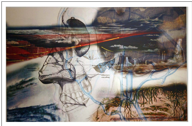
FIGURE 10 | The Storm Within Us.

The skull is the brain's helmet, protecting it from outside impact. But it is useless against inside attack and becomes a barrier