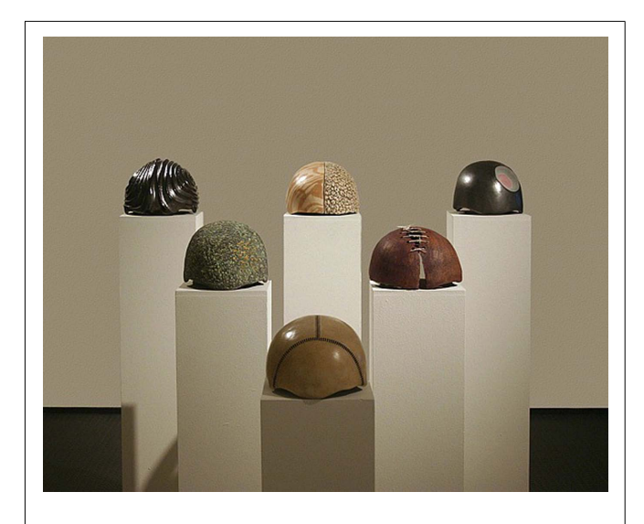
FIGURE 6 | Helmet Series.

She writes: "Brain surgeons can now pinpoint their surgery – what to cut, what to leave intact. In the physical tangle of neurons and synapses, where does the soul, the essence of individual personality, reside?" Constance Jacobson, in the Tome Series , puts dark patches on her brain slices to locate the protein plaques and tangles of dead cells that starve and kill the neurons in the brain of an Alzheimer's patient.