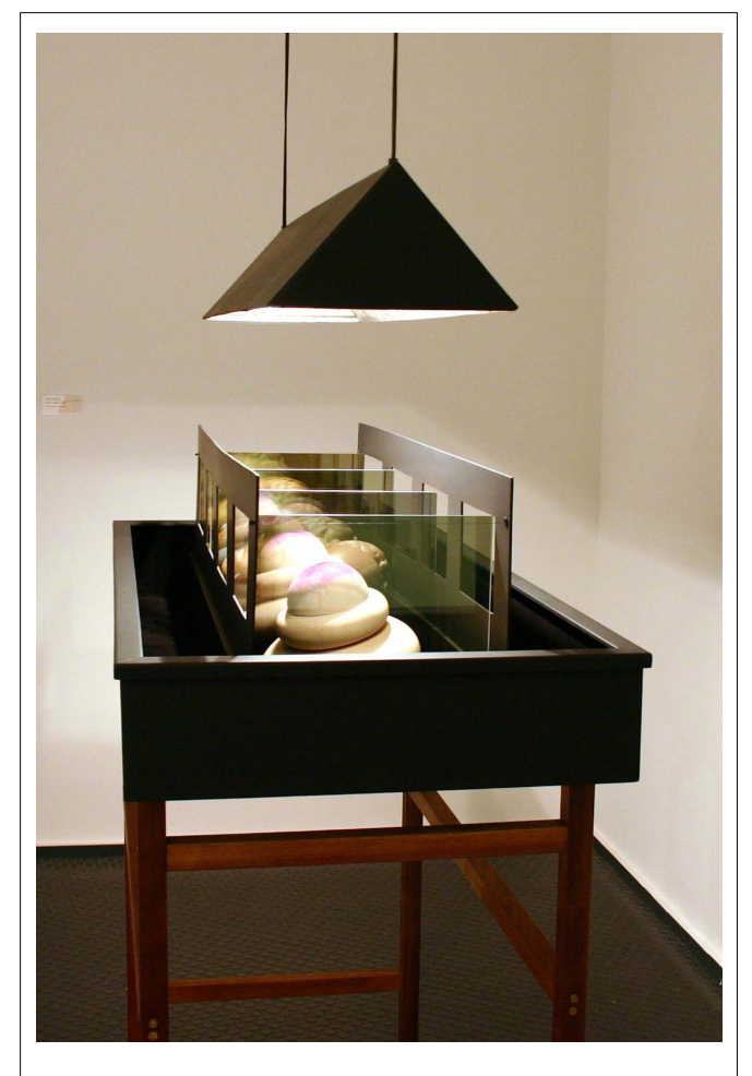
FIGURE 8 | Three is Company.

Dumas' work is not a celebration of identity, neither cultural, national, nor gender. The three pieces of meat labeled "me," "you,"