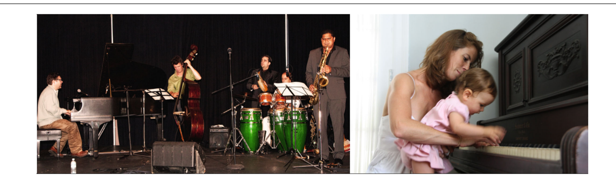
FIGURE 1 | Illustrations of temporal and affective entrainment. The skills of musical ensembles such as a Cuban Jazz band embody temporal entrainment and musical joint action. Affective entrainment

can be seen in early forms of joint action between an infant and caretaker, and might provide a foundation for the development of musical skills.