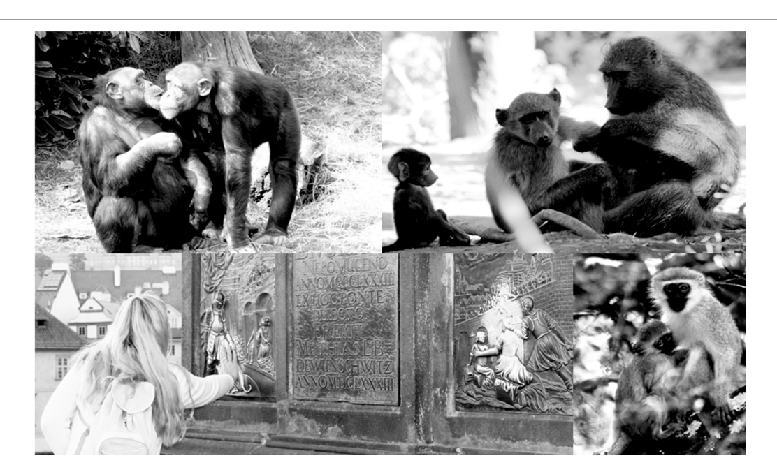
FIGURE 3 | Behaviors supporting an association between microbial-transmission and social bonding in primates. The intense sociality of primates provides several different direct (i.e., with contact between individuals) and indirect (i.e., mediated by any environmental feature) opportunities for the transmission of microbial-life associated to a social-bonding mechanism. Important examples (described in more detail in main text) include: (upper-left) mouth-to-mouth contact (in chimpanzees, Pan troglodytes): where microbial-life may be directly transmitted in saliva between individuals; (upper-right) social grooming (in savannah baboons,

Papio cynocephalus): where groomers may feed on ectoparasites or food-debris, allowing for the transmission of microbiota; (bottom-right) lactation (in vervet monkeys, Chlorocebus aethiops): where microbiota directly acquired from the mother helps feeding bacterial communities which in turn help offspring assimilating milk's nutrients; and (bottom-left), indirect transmission of microbiota mediated by a social tradition (i.e., touching religious objects), a possible pathway for the homogenization of microbial-life across individuals of a culturally defined human group.