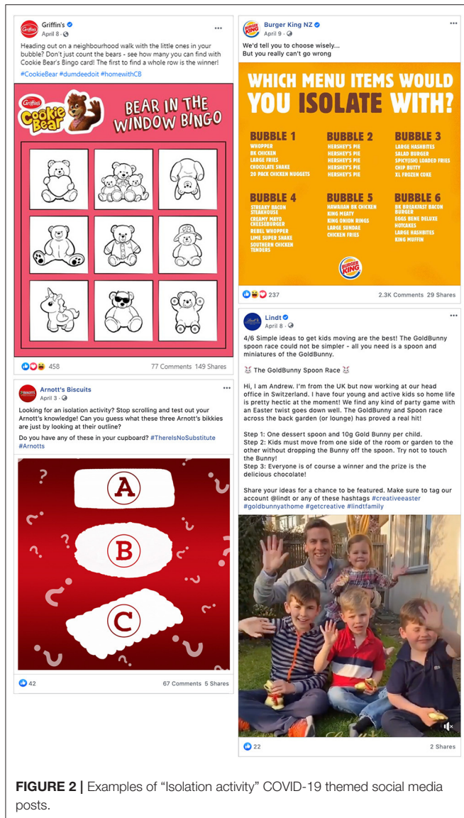
FIGURE 2 | Examples of “Isolation activity” COVID-19 themed social media posts.

the ASC Code by encouraging excessive consumption in the general population. Because of the vague language of the Principle in the ASC that states “Advertisements must be prepared and placed with a due sense of social responsibility to consumers and to society,” and “Advertisements must not undermine the health and well-being of individuals” it is arguable that all unhealthy food and beverage brands promoting consumption of their products with COVID-washing techniques were undermining the ASC.