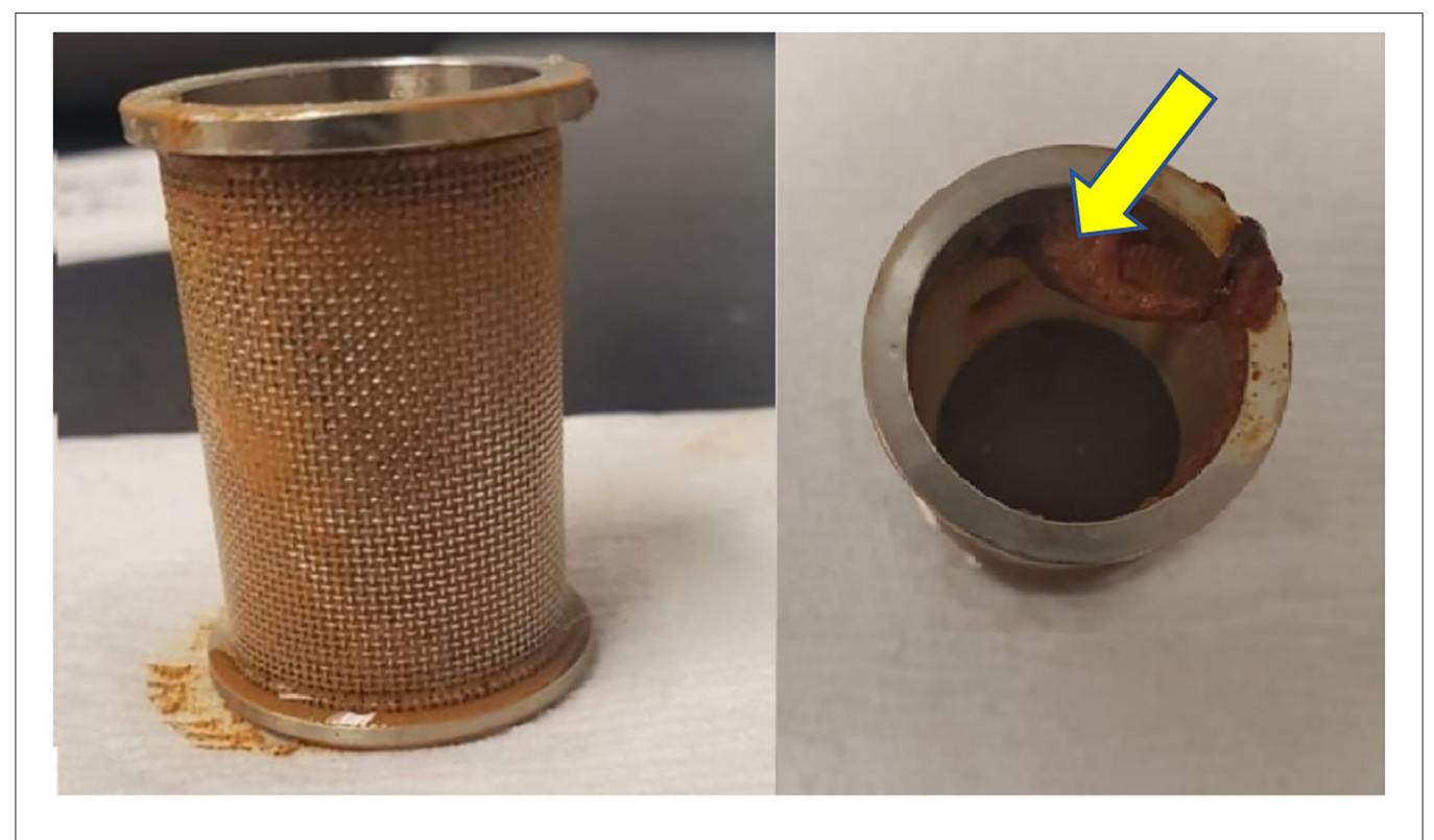
FIGURE 3 | GSE capsule residues within the dissolution basket after 2 h dissolution in 0.1 N hydrochloric acid (pH 1.2) (as indicated by arrowheads).

that some products were sensitive to chosen test conditions, namely, beaker size and the equipment used in dissolution study (13). Because of the limitation of our laboratory and costs, we did not optimize these parameters, and these aspects might be further improved. The results also indicate that the bioactive compounds may be not released properly from GSE capsules in the 0.05 M acetate buffer (pH 4.6), while these compounds were successfully released from GSE capsules in 0.1 N hydrochloric acid (pH 1.2).