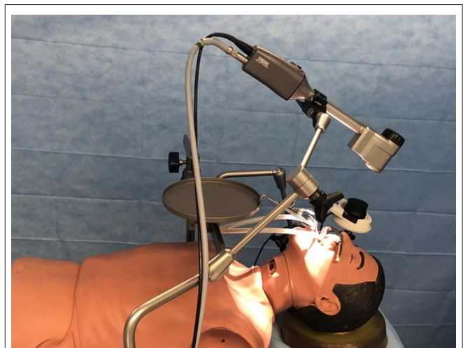
FIGURE 3 | Tests on the mannequin.

The first problem encountered in this study was in identifying the best work setting. After some tests on a mannequin, an ergonomic setting was identified with the optical body assembled on a mechanical holder with three joints and with an extension arm, fixed to the operating table ( Figure 3 ). The same layout, using a different terminal, allows both the exoscope and the 3D laparoscopic video telescope with a diameter of 10 mm to be set up, and it is useful to extend the angled vision to the base of the tongue and to the entrance of the piriform sinus. However, using this holder, the exoscope is not easy to position and move; at present, this is a weak point of the technique that makes maneuvering and setting up the optimal operative position less fluid.